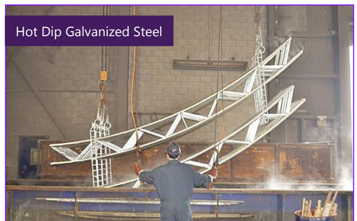
Hot Dip Galvanized Steel