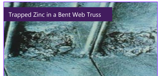
Trapped Zinc in a Bent Web Truss

To ensure HDG sectional steel, such as trusses, meet the highest standard, vent holes must be reinforced to parts, pieces, end plates, and similar features. Open web trusses meet these standards. As the components are immersed in molten zinc on an angle, vent holes must be arranged so the zinc can run in and out freely of corners and angles. Otherwise, zinc may get trapped in these 'pockets' resulting in defects, as is common in bent web trusses. This causes buckling and corrosion from the inside of the steel trusses, resulting in a weaker overall fabric building. Be sure that the fabric structure company you choose aerates all corners of the welding points so the zinc penetrates and coats the steel while avoiding pockets for zinc to trap.